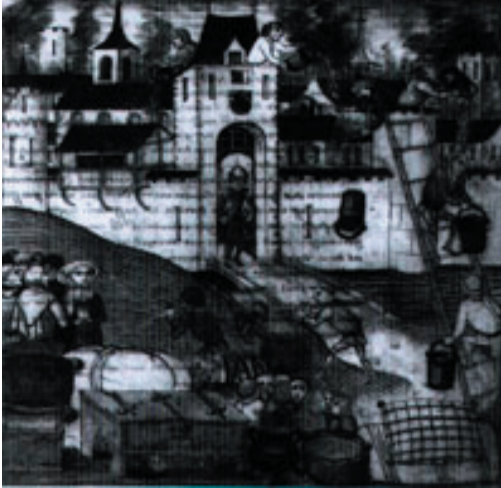
Diebold Schilling, Amtliche Berner Chronik, 1474–83. (Bern, Burgerbibliothek, Mss. hist. helv. I, Bd. 1, S. 289)

The people of Bern were warned. A fire in the Junkerngasse destroyed 52 houses on 28 April 1405, a bad omen predicting further suffering, according to the reports in the chronicles of the city of Bern, written by city clerk Konrad Justinger.